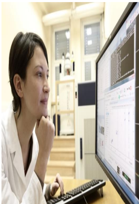
Funding for young researchers